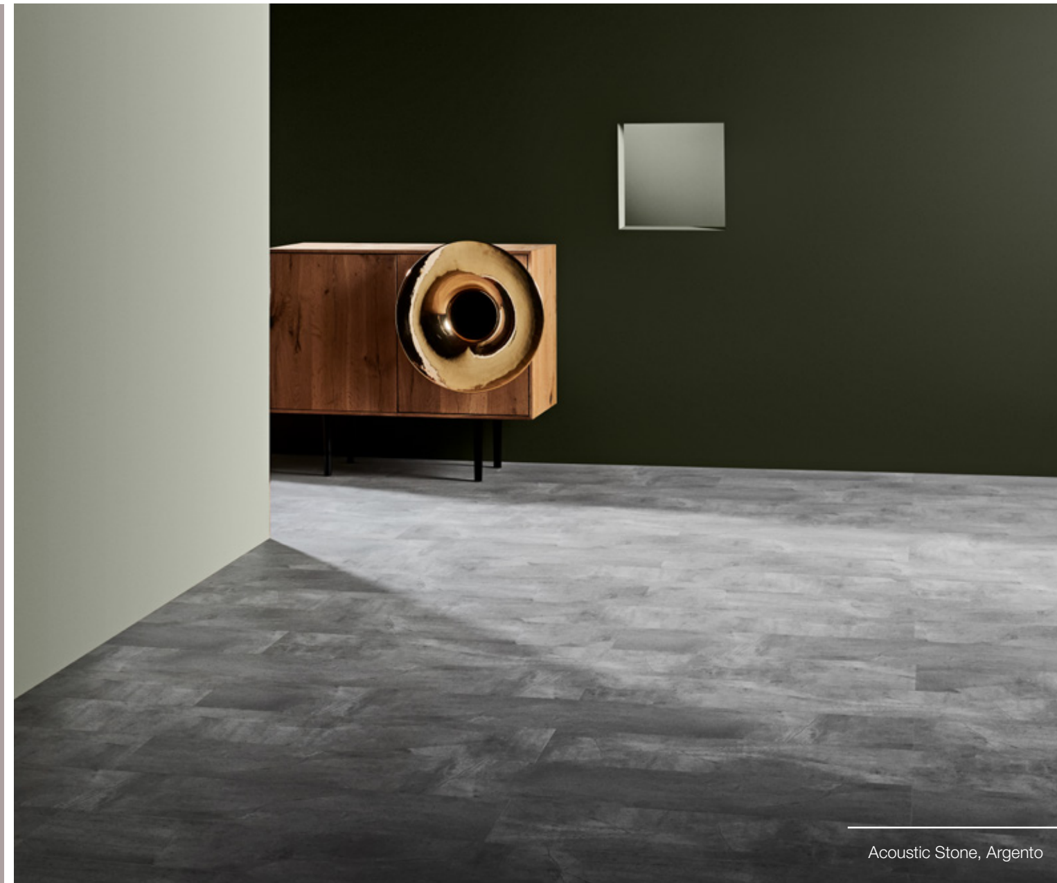
Acoustic Stone, Argento

Signature Floors has engaged the support of Marshall Day Acoustics to analyse prediction reports in alliance with the Association of Australian Acoustical Consultants (AAAC).