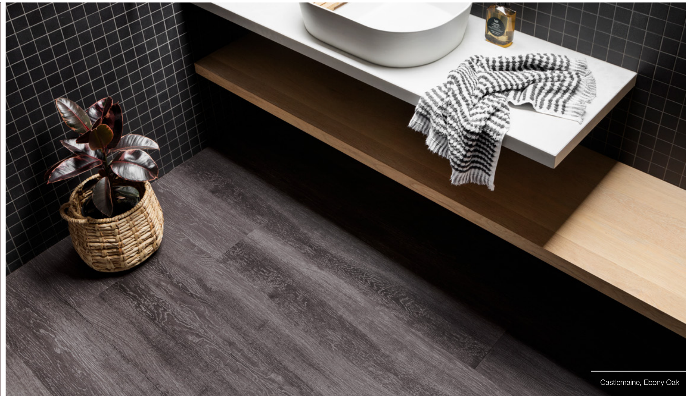
Castlemaine, Ebony Oak

These NCC requirements do not apply to Office, Education, Hospitality and other commercial buildings.