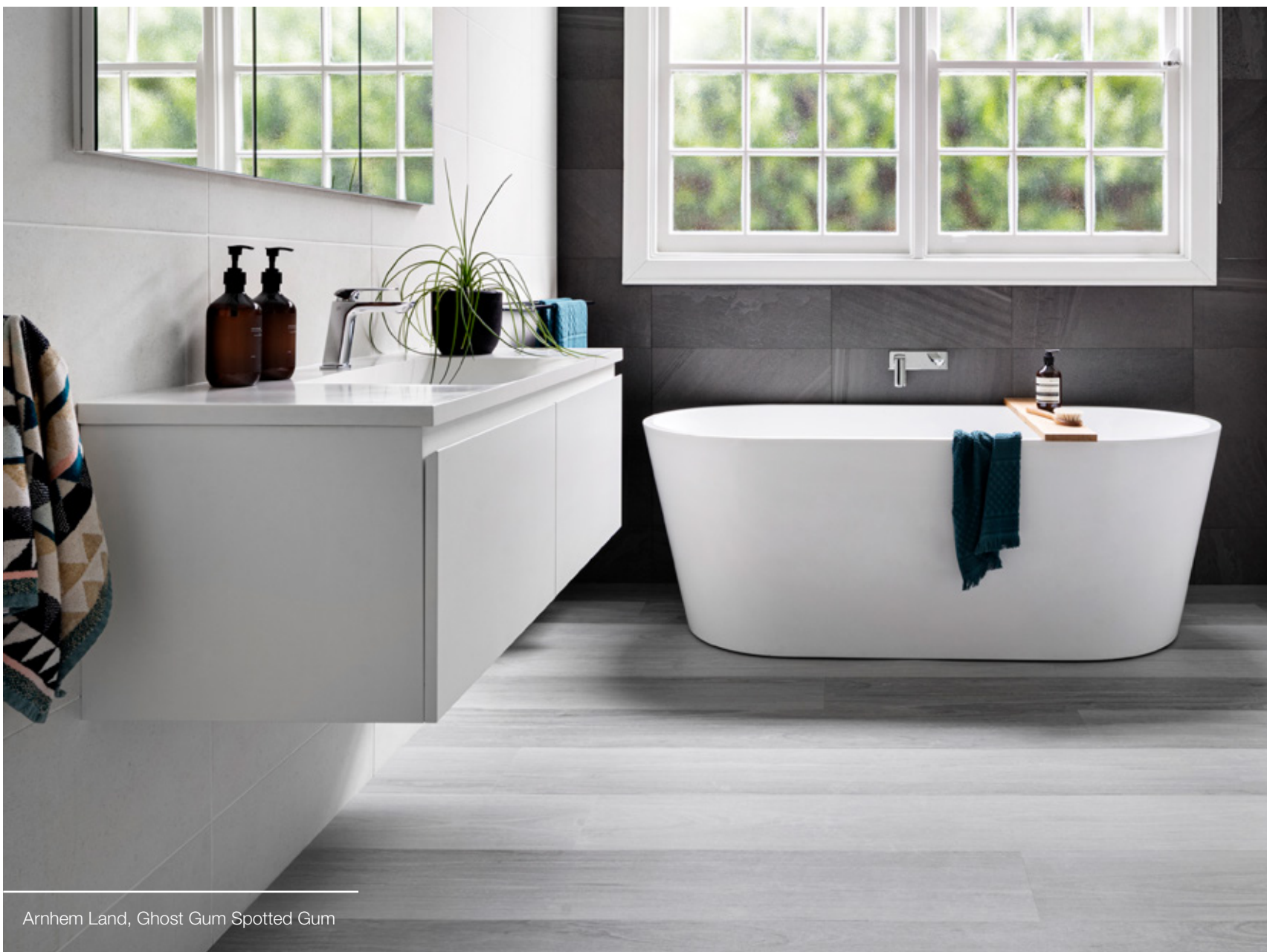
Arnhem Land, Ghost Gum Spotted Gum