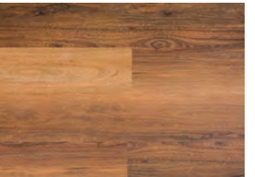
Mountain Ash Spotted Gum* CAS76813 Stringybark Spotted Gum* CAS76802