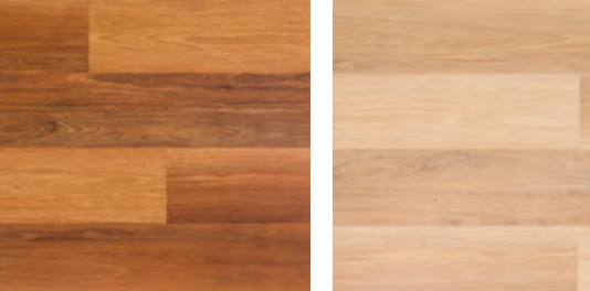
Coolabah Spotted Gum* CAS76804