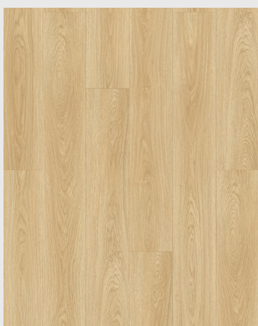
WF804 Ginger Ale