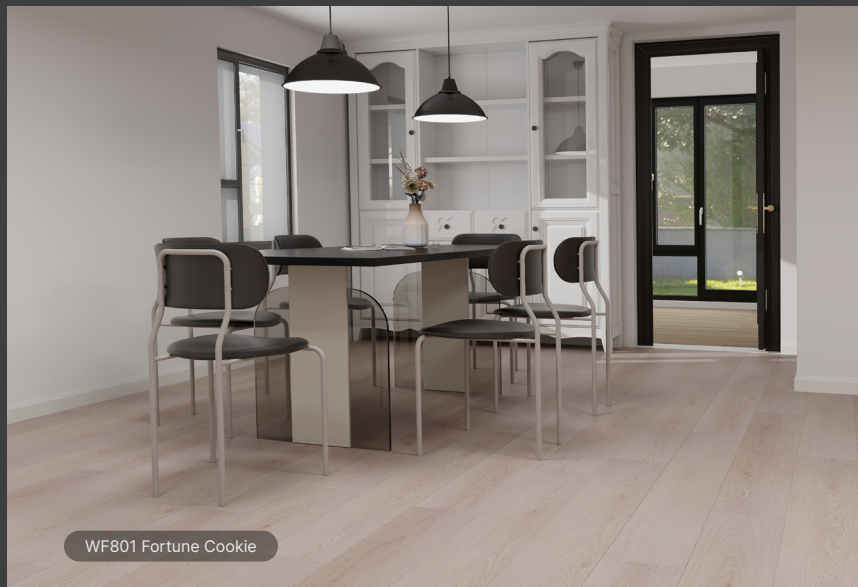
WF801 Fortune Cookie

Hydrocore isn't just a floor; it's a foundation for your life. Built to withstand the rigors of daily traffic, whether it's bustling family activities or high-volume commercial use, Hydrocore ensures longevity with a lifetime residential warranty and a 5-year commercial warranty end.