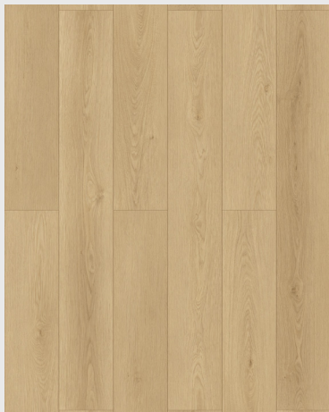
WF801 Fortune Cookie