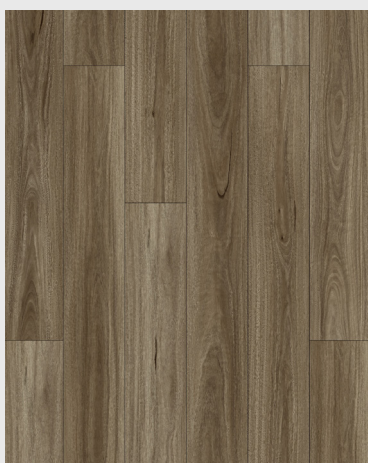
WF808 Spotted Gum