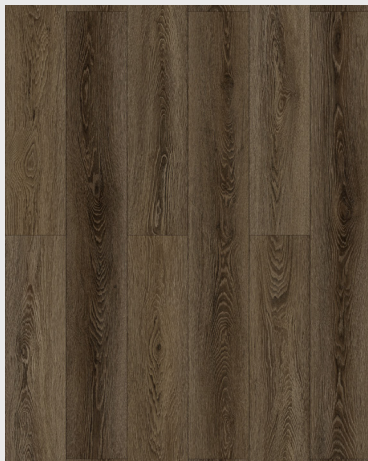
WF802 Café Noir