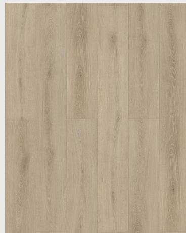
WF803 Golden Fog