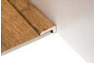
▲ L ANGLE