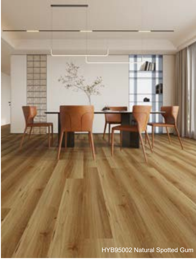
HYB95002 Natural Spotted Gum