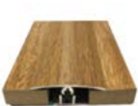
▲ T-MOULDING (Aluminium)