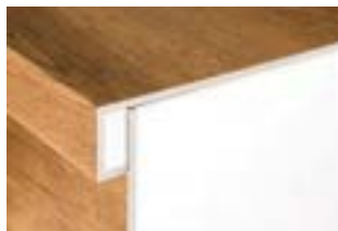
▲ STAIR NOSE