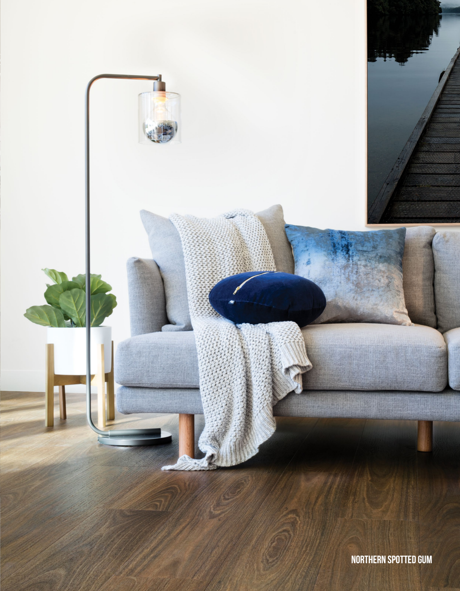
NORTHERN SPOTTED GUM