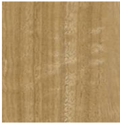
545 Prime Blackbutt