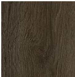
795 Eclipse Shadow