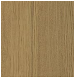
350 Stellar Oak