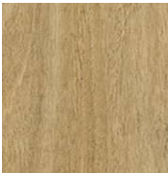
555 Starry Spotted Gum