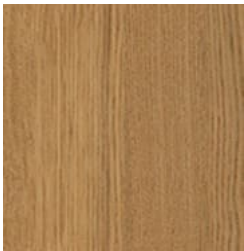
560 Galactic Grove