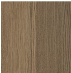
190 Nebula Walnut