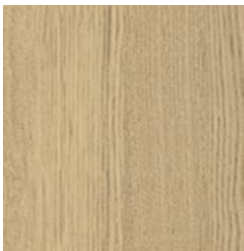
110 Solar Drift