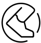
Strong & Durable