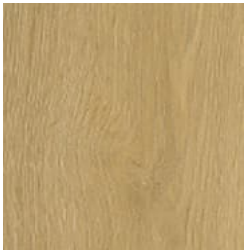
325 Aurora Pine