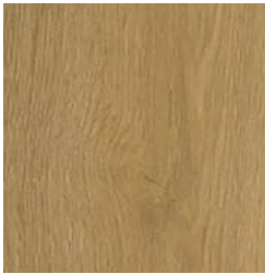
365 Celestial Driftwood