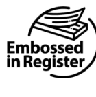
Embossed in Register