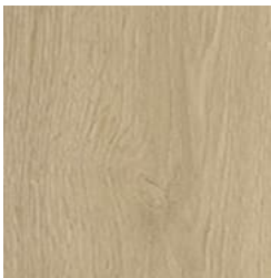
120 Lunar Ash