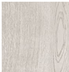
700 Pebble Bay