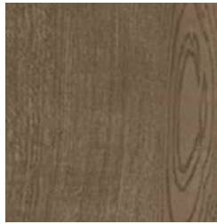
170 Rustic Bronze