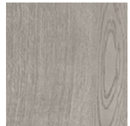
550 Evening Haze