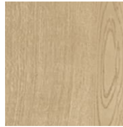
510 Harbour Oak