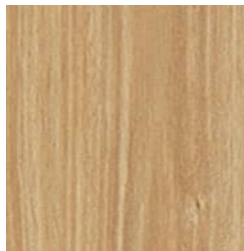
525 Alpine Blackbutt