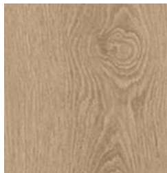
530 Coastal Driftwood