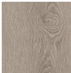
560 Mocha Java