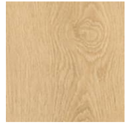
520 Sunset Birch