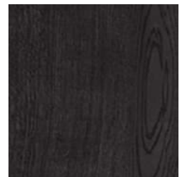
790 Ebony Ash