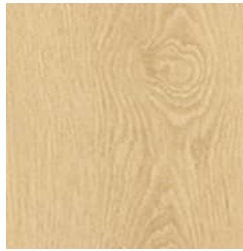
320 Amber Glow