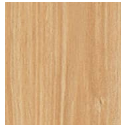
545 Eastern Blackbutt