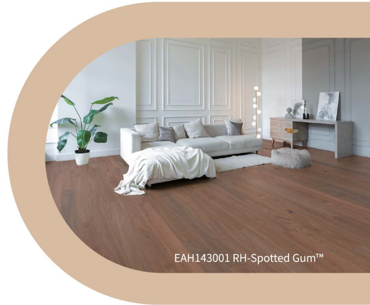
EAH143001 RH-Spotted Gum™