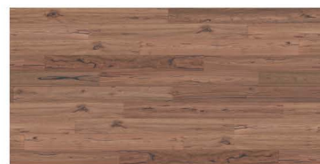
RH-Spotted Gum Rustic Grade™