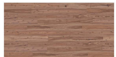
RH-Blackbutt Rustic Grade™