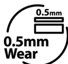
0.5mm Wear Layer