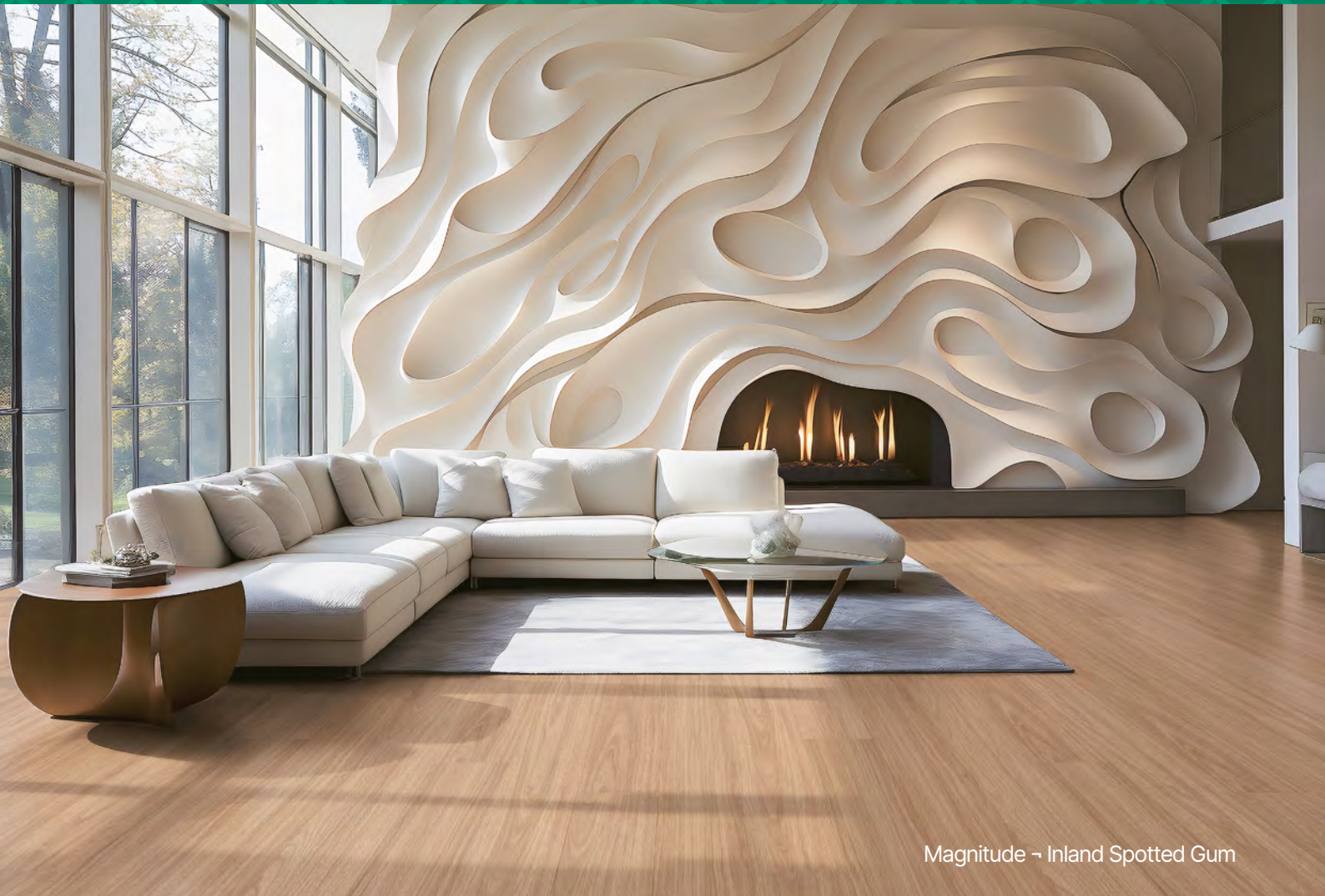
Magnitude - Inland Spotted Gum