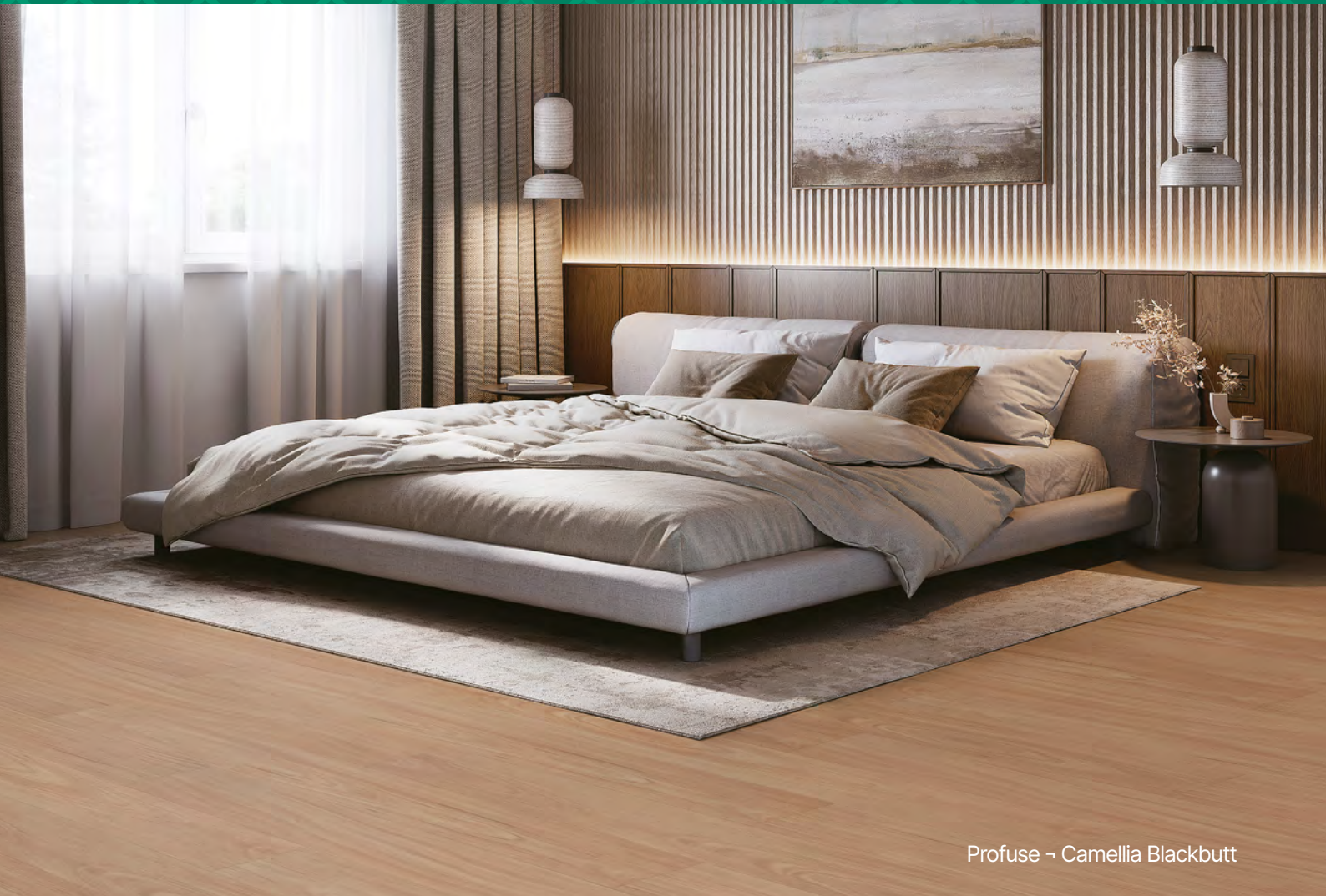
Profuse - Camellia Blackbutt