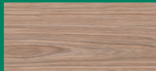
Vivid Blackbutt 880A07