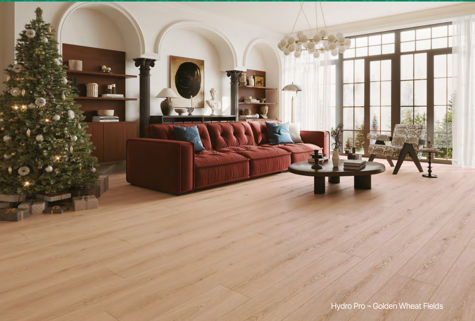
Hydro Pro - Golden Wheat Fields