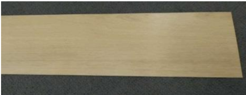
Photo of tested product

Results in accordance with section 8.4 have not been included in the report. They are available upon request.