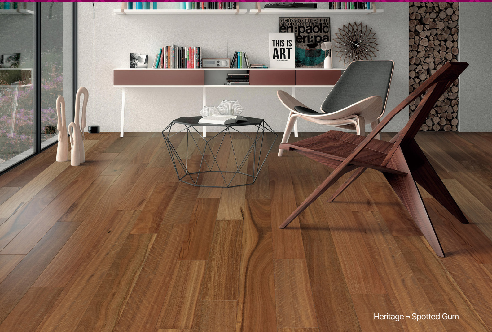
Heritage - Spotted Gum