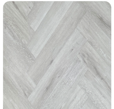
Estate Grey Oak