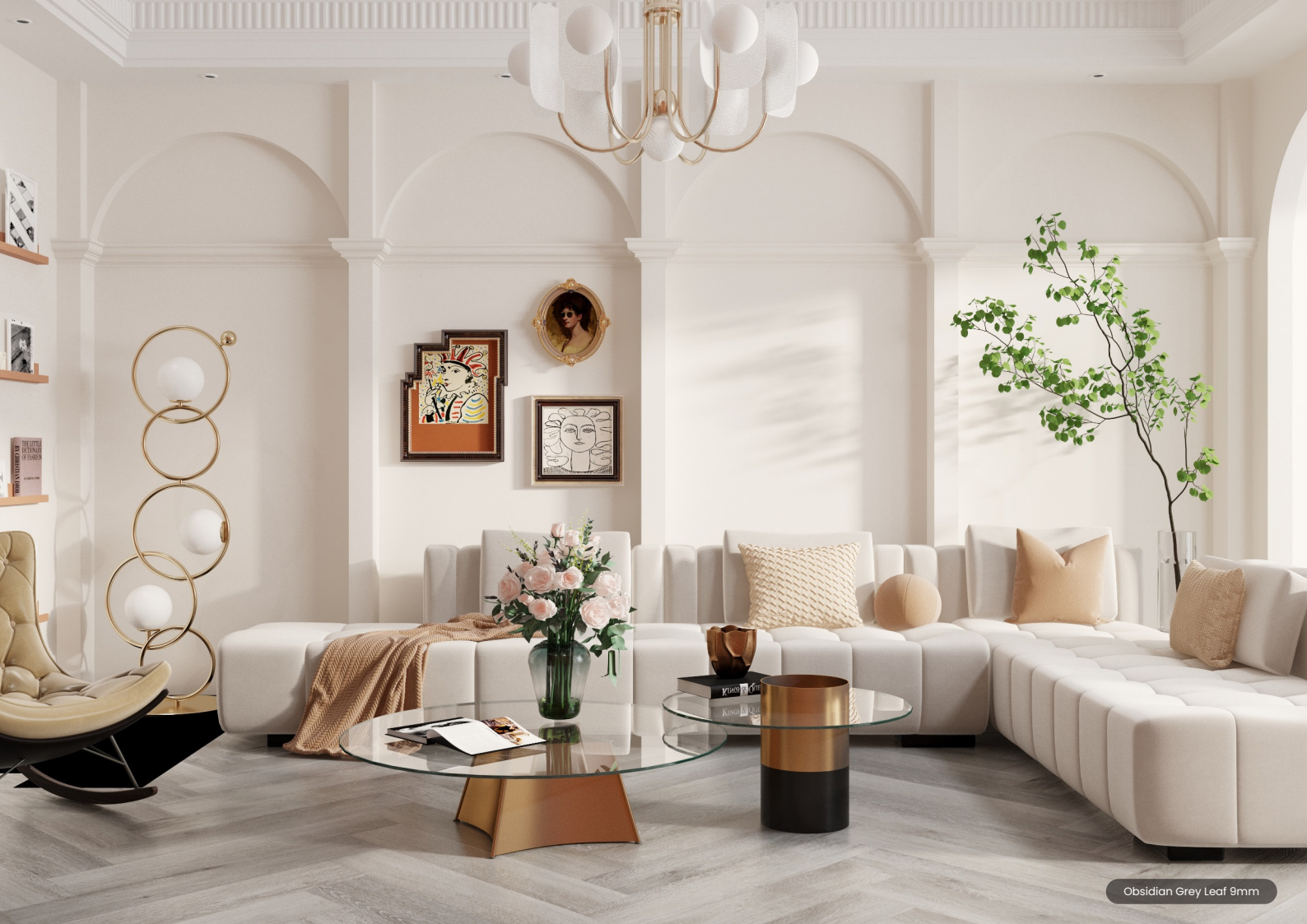
Obsidian Grey Leaf 9mm