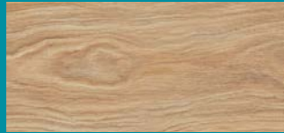
Retreat Blackbutt 760202-VL