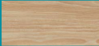
Cabin Blackbutt 760201-VL