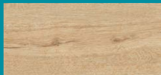
Daylight Villa 760206-VL