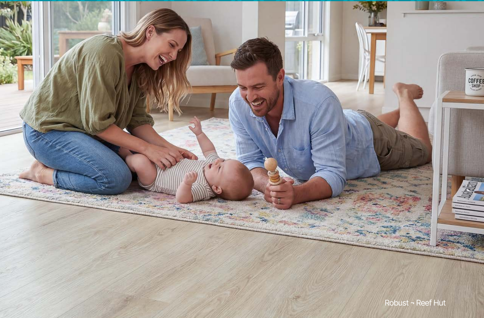
Robust - Reef Hut