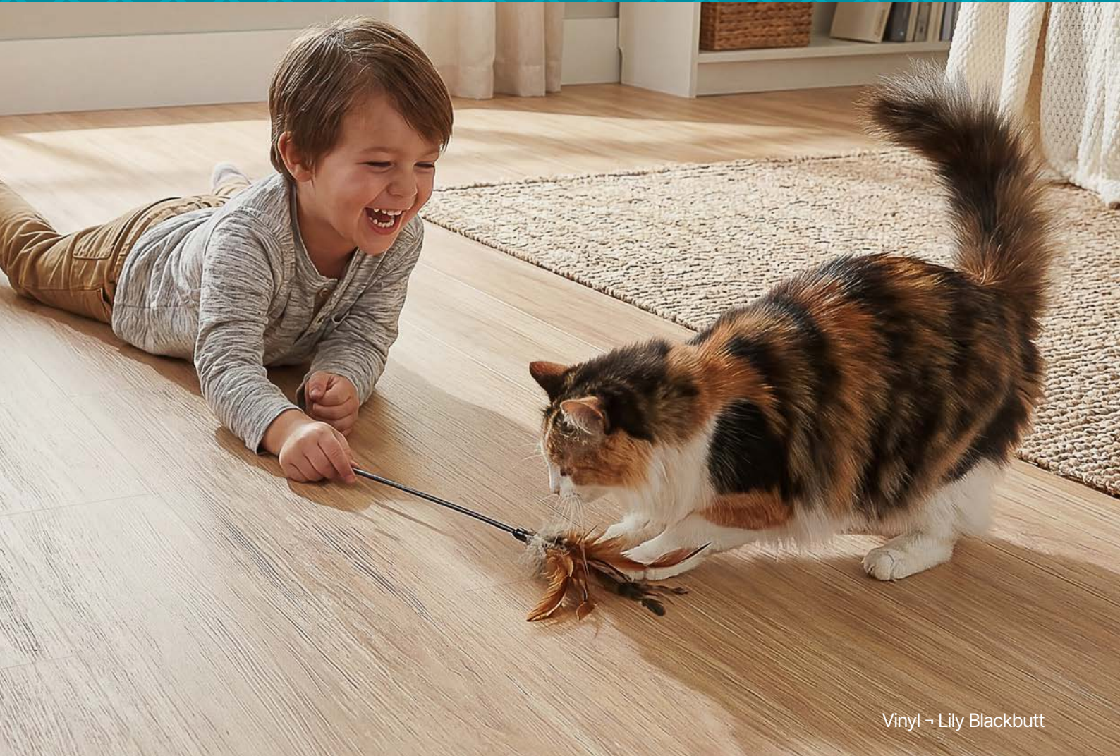
Vinyl - Lily Blackbutt