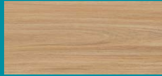
Rosy Blackbutt 760452