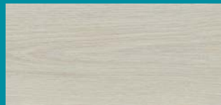
Jasmine Weave 760454