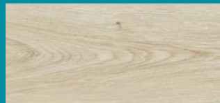
Silk Peony 760458